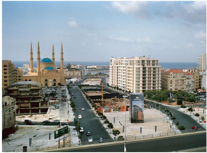
Figure 2 Martyr's square. Left: 1960s, Right: 2000s

figures, cultural symbols, functions, architectural styles, stone types, etc. The attempted reconstruction has thus turned its own heritage and culture into a “product”, a touristic souvenir. It is Hannah Arendt's “The Crisis of Culture” that is best exemplified here, as “the life process of society [...] will literally consume cultural objects, eat them up, and destroy them.” 10