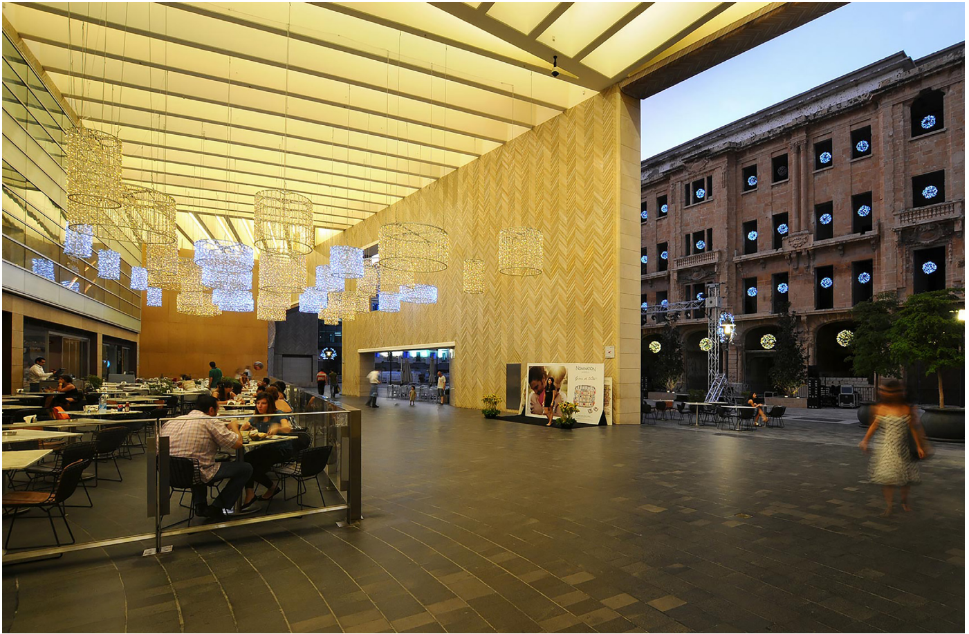
Figure 3 Ajami square today

Bab Idriss and Ajami squares embody both the generic modernity and generic historicity illustrated in Michael Sorkin's notion of the city as a theme park, where pseudo-historic marketplaces, gentrified zones, corporate enclaves take over the traditional public space. The theme park, explained in "Variations on a Theme Park: The New American City and the End of Public Space", is an environment in which structures are highly ordered and controlled, in order to minimize interaction among citizens. In-between spaces disappear as everything becomes highly designed and ordered, limiting social engagement to whatever is offered within the controlled space. "Whether it represents generic historicity or generic modernity, such design is based in the same calculus as advertising, the idea of pure imageability, oblivious to the real needs and traditions of those who inhabit it" 13 , writes Sorkin.