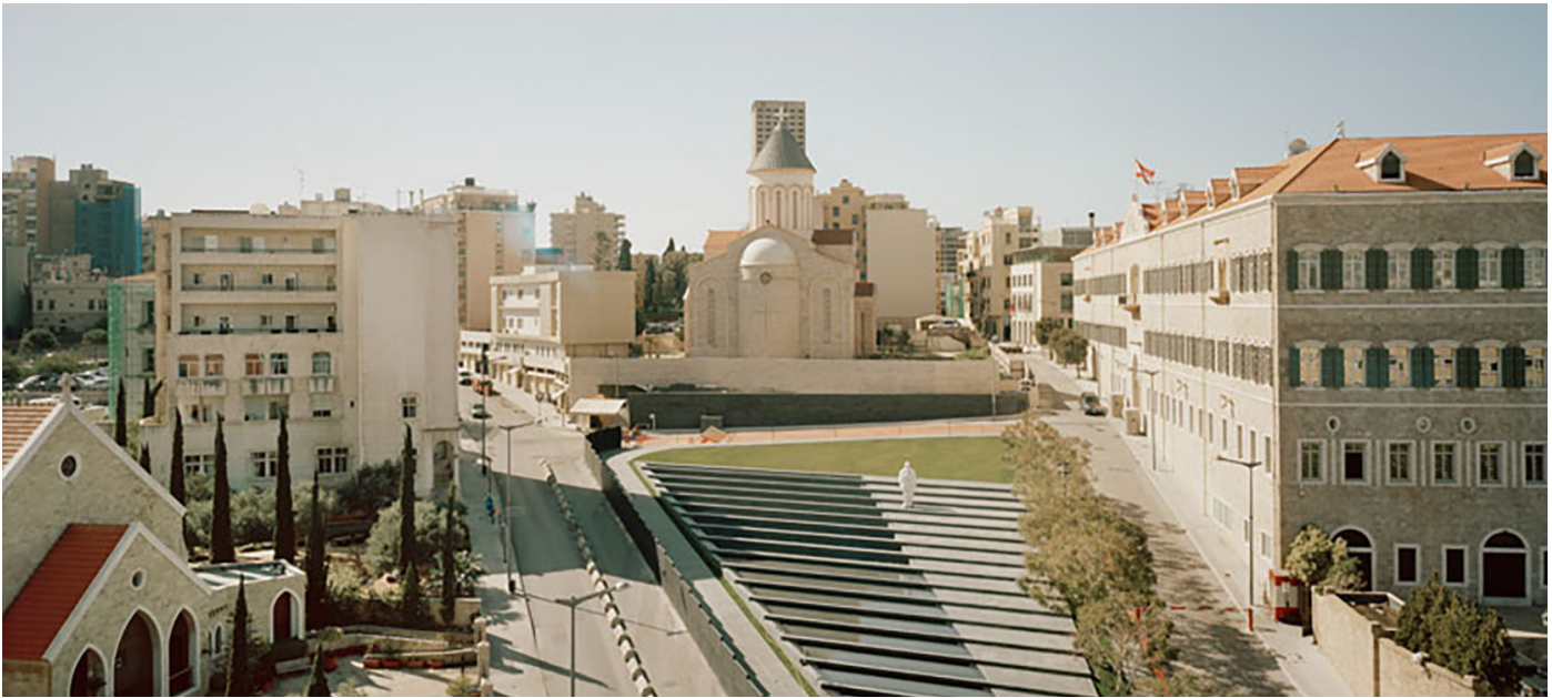
Figure 4 National Unity square

plaza, clarifies certain aspects of its design. For instance, the reason for wide raised planters is because “the buildup of the plaza did not allow for planting, hence, we had to design raised planters in order to achieve enough planting depth.” Moreover, when asked about design restrictions imposed by the company, the architect explained that since “the same paving treatment had to be extended to both pedestrian and vehicular areas”, they were inclined to choose a “dark stone for paving”, such that “oil stains or car wheel marks wouldn’t be too evident” 15 . Both answers come to demonstrate that, in the design process, little if any consideration was given to public use.